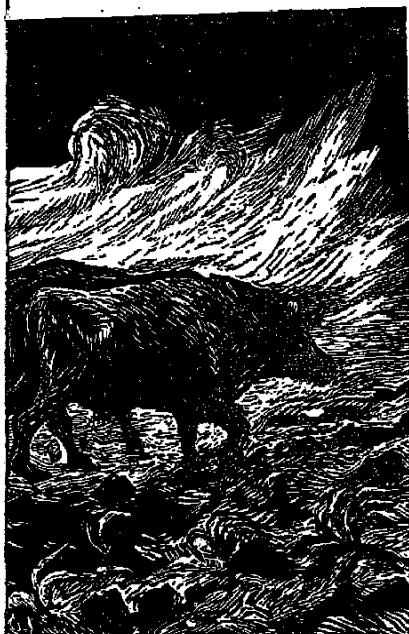
by A. Garcia Bustos

Some of the actions proposed at Périgueux include regional demonstrations, the blocking of roads around October 15, a march on Paris on the day a motion of censure on agricultural policy will be put to the vote in the Assembly, convening of general councils to oblige them to take a stand on agricultural problems and to become the spokesmen of the peasants to the prefects. On the day of the Périgueux meeting the peasants in Cambrai demonstrated, shouting "No to stabilisation on the back of the peasants and wage-earners", posters were carried through the streets of Lyon by peasants from the Rhône region, to demonstrate that the Government will have to deal with the working peasantry of our country as a whole.